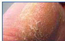
Without skin care