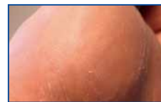
After regular use of Callusan FORTE