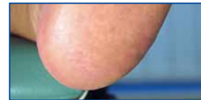
After regular use of Callusan EXTRA