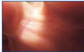
After regular use of Callusan FRESH