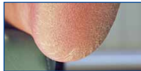
Without skin care